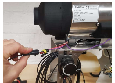
1) Disconnect power

- To exit "service mode" disconnect power.