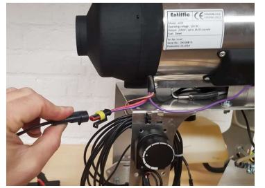
1) Connect power